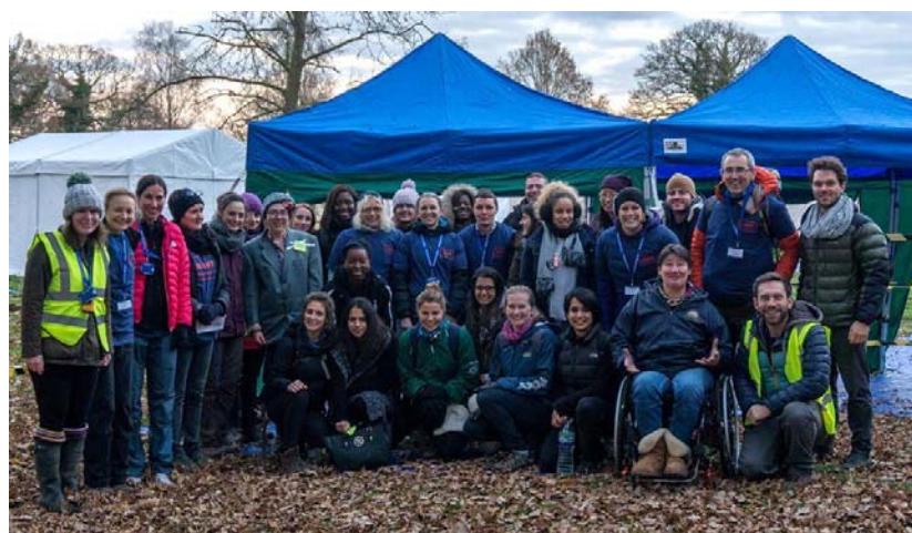
UKEMT teams, trainers and role players following the first ever field training for disaster response rehabilitation teams.

This past year has seen the culmination of several pieces of work, culminating in the launch of the first globally-accredited specialised emergency response rehabilitation team, or "Specialised Cell", a multi-disciplinary (medical, nursing and rehabilitation) team with its own independent operational capability. A dedicated spinal injury team is also currently under development in partnership with the International Spinal Cord Injury Society (ISCoS).